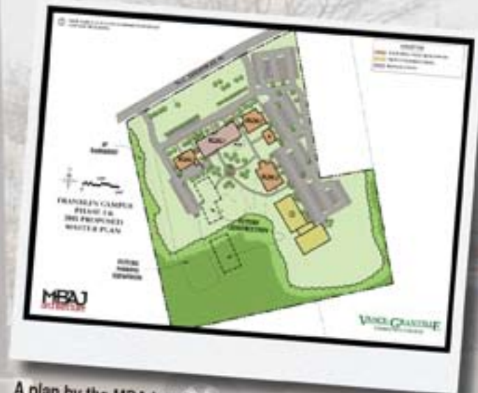
A plan by the MBAJ architectural firm shows possible locations for new construction at the Franklin County Campus.