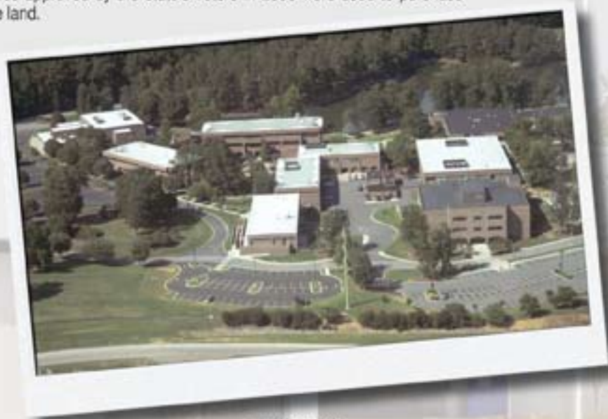
An aerial view of VGCC's Main Campus.