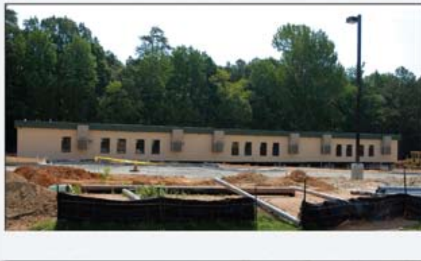
Construction began next to VGCC's Franklin Campus on the new modular unit that will provide space for Franklin County Early College High School.