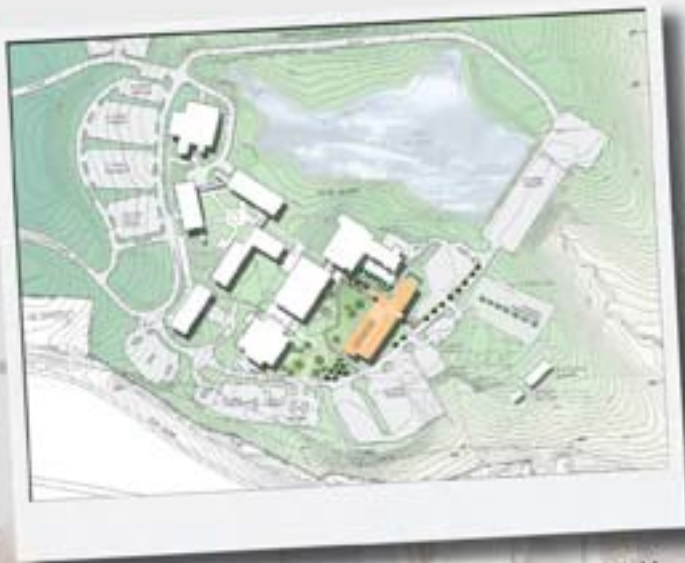
A preliminary site plan by the architectural firm, Pearce Brinkley Cease + Lee, shows a possible location for the proposed Allied Health Building on Main Campus.