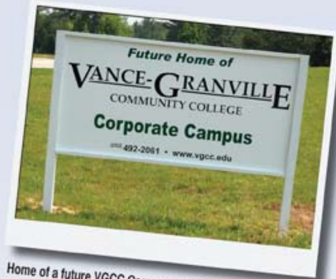
Home of a future VGCC Corporate Campus.