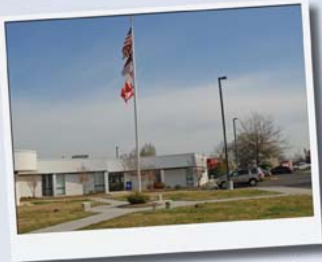
VGCC's South Campus has shared its library with the Granville County Library system for many years, but the county library will soon be relocating to its own facility.