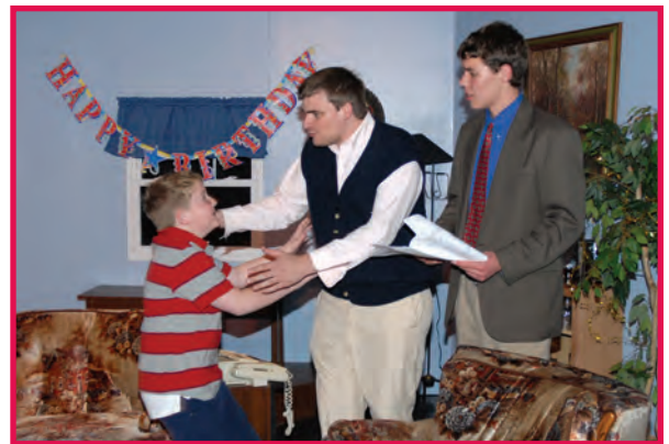
Following the success of "Harvey," drama students performed the comedy, "The Nerd."