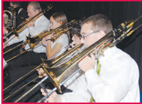
The VGCC community band entertained hundreds of area residents with numerous concerts during the 2008-2009 year.